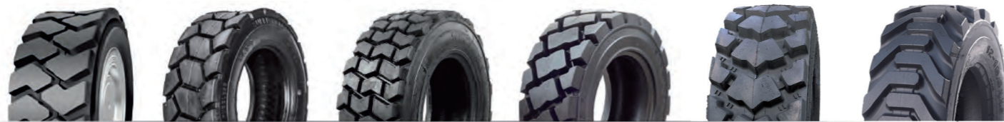
SKS-2 SKS-3 SKS-4 SKS-5 SKS-6 SKS-7