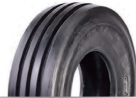
F-2 4 RIB